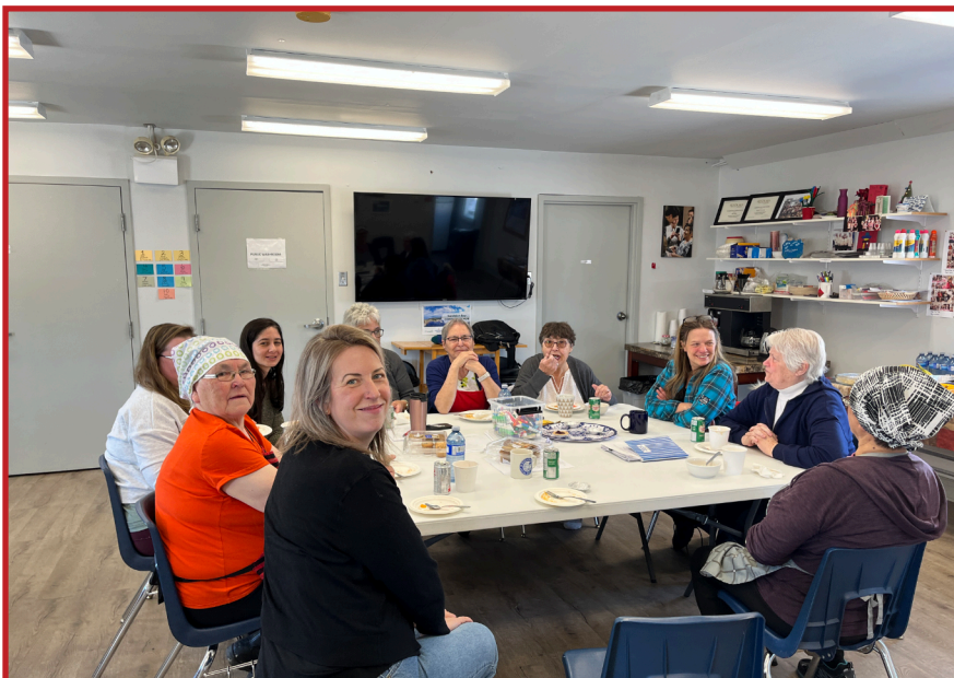
Pictured: ARC-NL researchers meeting with the 50+ club in Cartwright.